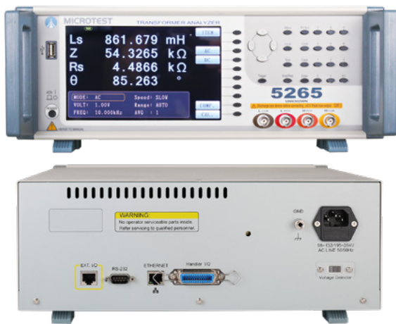
CE RS-232 Handler USB Host LAN EXT. I/O