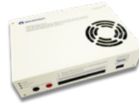
FX-000C28 2-in-1 Current Expand Box