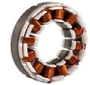
Motor stator coil

Unbalance DCR which happen on 3 phase motor may cause deflection on motor.