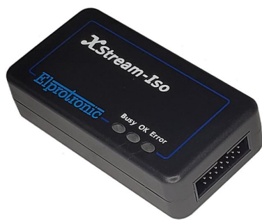
FlashPro-iMOTION (XS) Can Program Single Target

GSAS Micro Systems Pvt Ltd (GSASMSPL) has Partnered with Elprotronic Inc, Canada to provide Fast and Reliable Production Flash and Gang Programmers for iMOTION Devices. Elprotronic has been in the programming solutions market for 20 years providing best features for manufacturing processes in addition to basic programming of internal flash memory. It differentiates itself from others by offering a significant reduction of additional hardware needed for programming processes.