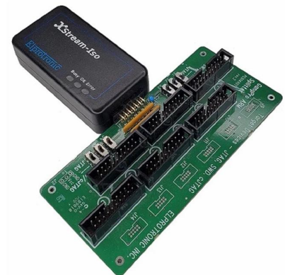
GangPro-iMOTION (XS) Can program up to 6 Targets in parallel