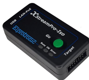
FlashPro-iMOTION (X2S) Can Program Single target in Standalone Mode