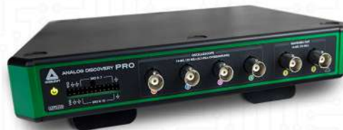
ANALOG DISCOVERY PRO 3000