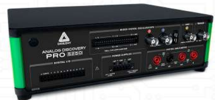
ANALOG DISCOVERY PRO 5000