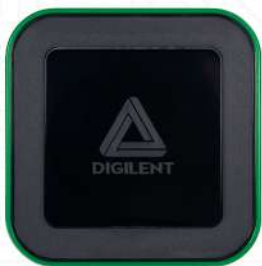
ANALOG DISCOVERY 3

Each product in this category contains an entire benchtop worth of instruments. Lovingly referred to as swiss army knife of electronics by our customer, the discovery family of products combine portability, usability, and flexibility with affordability. All the Modules use Waveform, our free software application that is compatible with Mac, Windows, & Linux.